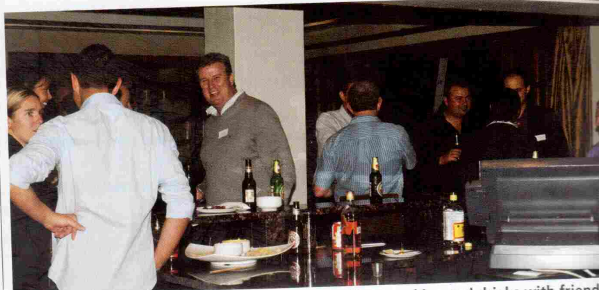
No speeches, no presentations, just some good old networking and drinks with friends