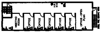
FIRST FLOOR SCALE 1:200

BUILDING 3 - MAIN CONFERENCE FACILITIES ELECTRICAL LAY-OUT